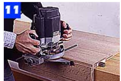
Using the router with an edge guide, make two or three passes, and cut the rabbet on the top rail/shelf assembly.

Next, use the router and edge guide to cut the rabbet along the back edge of the top rail/shelf assembly ( Photo 11 ) and along the back edges of the case sides. Use a chisel to square the rabbet ends. Mark the hinge mortise outlines on the case, and cut the outline using a chisel and a marking gauge. Pare the mortise to depth with a chisel. If you plan to set a turntable on the top shelf of the case, you should bore a hole through the shelf for a wire grommet. (See the materials list for grommet information.) The grommet we used requires a 1 3/4-in.-dia. hole.