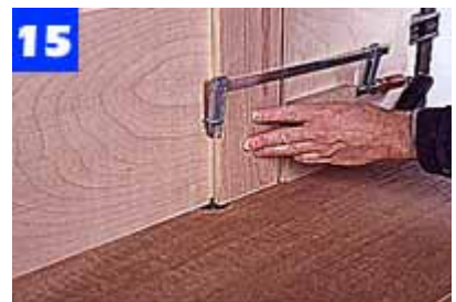
Cut the drawer side's dovetail in the router table. Clamp a backup block to the side, then move the side over the bit.

Clamp a tall fence to the router table, and clamp a backup block to each drawer side and back when you cut the dovetail on these parts ( Photo 15 ). The backup block--rather than the workpiece--tears out when it exits the bit.