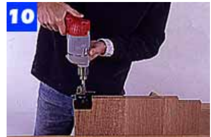
Make the center case shelf, cut the notches in its ends, and bore the holes in the notches using a doweling jig.

Cut out the notches in the middle shelf, mark the position of the shelf dowel holes, and then use a doweling jig to bore the holes ( Photo 10 ). When you've completed this, bore matching holes in the case side stiles. Finish laying out the joining-plate slots in the bottom shelf and case sides, then cut the slots. Clamp a straightedge to the sides to position the plate joiner.