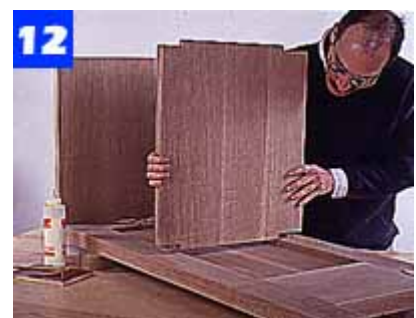
Apply glue to the slots, dowel holes, joining plates and dowels, then assemble the shelves to one case side.

To assemble the case, spread glue in the plate slots, dowel holes and on the dowels and plates, then join the shelves to one of the case sides ( Photo 12 ). Take care not to get any glue on the portion of the middle shelf that abuts the side panels. The panels must be free to expand and contract seasonally, and a glue bond will cause a panel to crack when this happens. With a helper, position the other side over the ends of the shelves, and then clamp the assembly. Compare opposite diagonal measurements on the case to check for square, then let the glue cure.