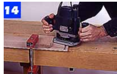
Clamp each drawer front to the workbench, and then use a router and dovetail bit to cut the dovetail dados.

Rip and crosscut the drawer parts. Install a dovetail bit in the router, and set the router to make a 1/4-in.-deep cut. Cut the dovetail dado in the drawer sides and the stopped dado in the drawer face ( Photo 14 ).