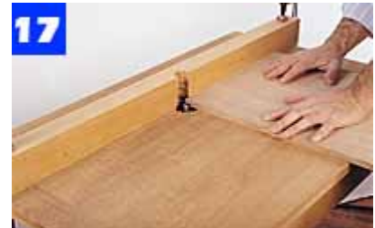
Install a straight bit in the router table, and then slide the door panel over the bit to cut the rabbet on the inside panel edges.

The cabinet door is built in essentially the same way as the rest of the cabinet. Keep in mind, however, that the panel groove is only 3/8 in. wide, so you must cut a shallow rabbet around the inside edge of the panel. To do this, use a straight bit in the router table, and push the panel slowly over the bit ( Photo 17 ). Cut the cross-grain rabbets first, then cut the rabbets along the grain. Any small amount of grain that is torn out while cutting across the grain will then be removed.