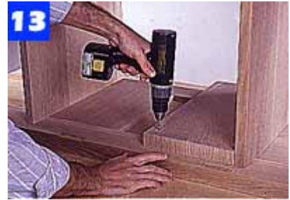
The drawer blocking is made from two pieces of plywood with solid oak facing. Screw the blocking to the case side.

Glue together two pieces of 3/4-in.-thick plywood to form the drawer blocking, then glue a solid oak strip to the block as a facing. Note that the grain on the facing should run horizontally to match the drawer faces. Screw the blocking to the case side ( Photo 13 ).