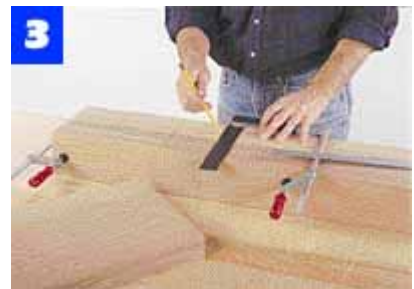
Lay out the mortises in the case stiles by clamping the workpieces together, and mark across them using a square.