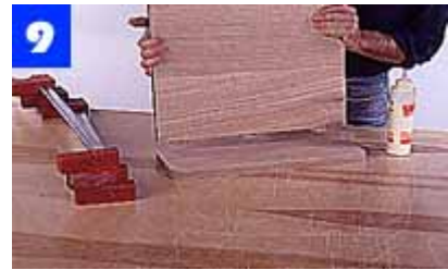
After you have cut the joining-plate slots in the top shelf and back rail, test fit the pieces, then glue and clamp them together.

Cut the rounded top corners on the back rail using a sabre saw. Mark the locations of the joining-plate slots in the rail and top shelf, and then cut the slots. Dry assemble the two pieces ( Photo 9 ). Next, spread glue in the slots, on the plates and on the edge of the glue joint, and clamp the two parts together.