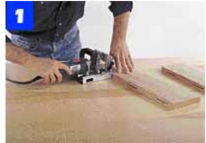
Cut joining-plate slots in the boards' edges. The plates keep the boards aligned while they are being glued and clamped.

Use a plunge router with a 1/2-in.-dia. up-cutting bit and an edge guide to cut the mortises ( Photo 4 ). Clamp two stiles together before routing to provide a stable surface for the router, and cut the mortise in two or three passes.