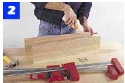
To ensure a properly bonded joint, apply glue to the joining-plate slots, the board edges and the joining plates.