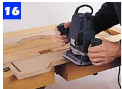
Cut out the profile on the top edge of each drawer front. Next, use the router to cut the cove along the edge.

After marking the curved cutout on the drawer faces, make the cuts with a sabre saw. Use a router and cove bit to shape the edge of the cutout ( Photo 16 ).